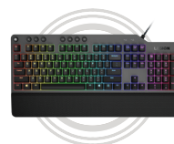
Legion K500 Gaming Keyboard