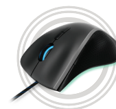
Lenovo Legion M500 RGB Gaming Mouse