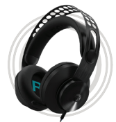
Lenovo Legion H300 Gaming Headset

* Example of Lenovo Legion catalogue naming convention