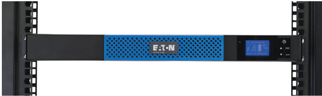
5P lithium-ion UPS rackmount UPS available in 1500 VA and 1550 VA