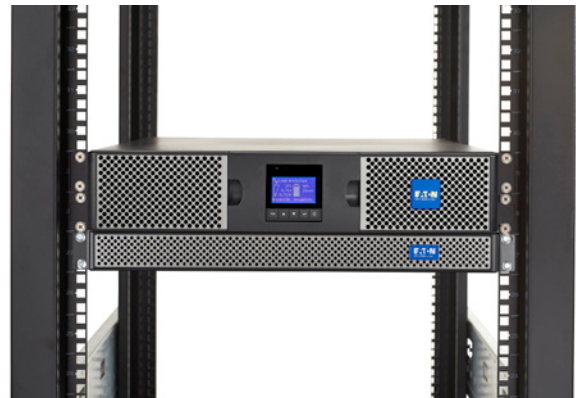
9PX 2U UPS with 1U EBM in 4-post rack