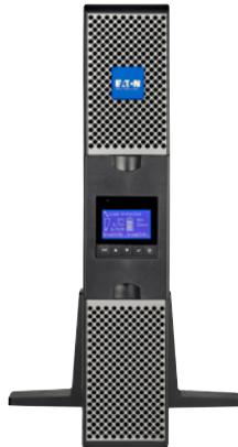
9PX lithium-ion UPS tower available in 1–3 kVA