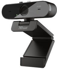
PRODUCT VISUAL 3