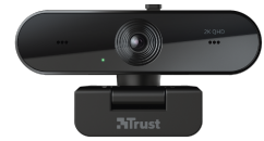
PRODUCT FRONT 1