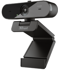
PRODUCT VISUAL 1