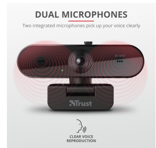
PRODUCT PICTORIAL 3