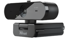
PRODUCT VISUAL 2