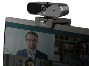
PRODUCT EXTRA 1