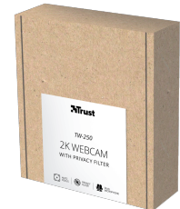
PACKAGE VISUAL 1