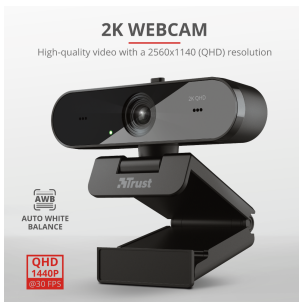
PRODUCT PICTORIAL 1