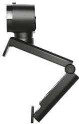
PRODUCT SIDE 1