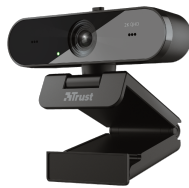
PRODUCT VISUAL 4