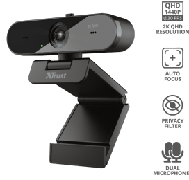
PRODUCT ESHOT 1