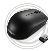
Lenovo 300 Wireless Compact Mouse