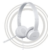
Lenovo 110 Stereo USB Headset