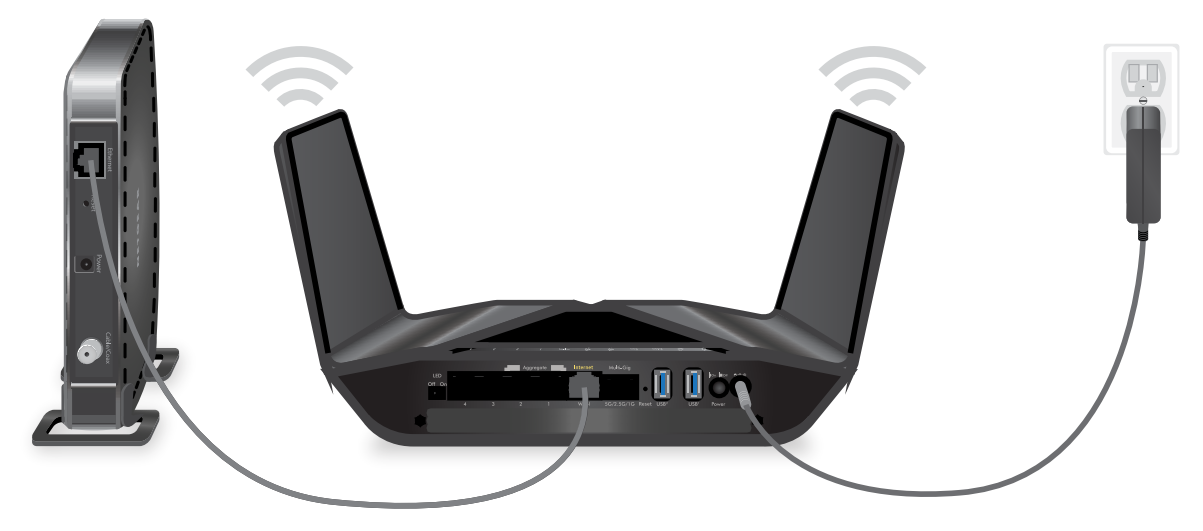
Figure 6. Cable your router

Power on your router and connect it to a modem.