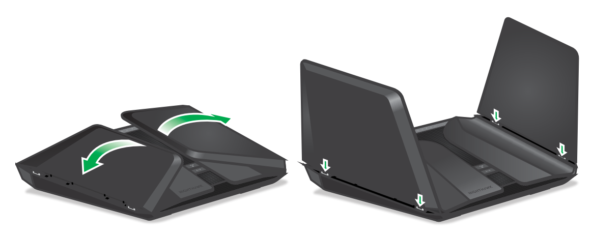
Figure 4. Position the antennas

Before you install your router, extend the antennas as shown in the following figure.