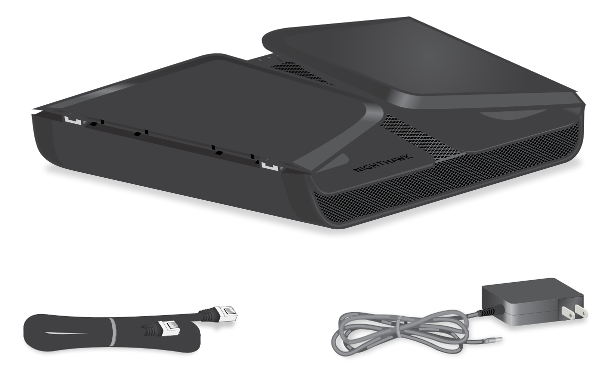
Figure 1. Package contents

Your package contains the router, the power adapter, and an Ethernet cable.