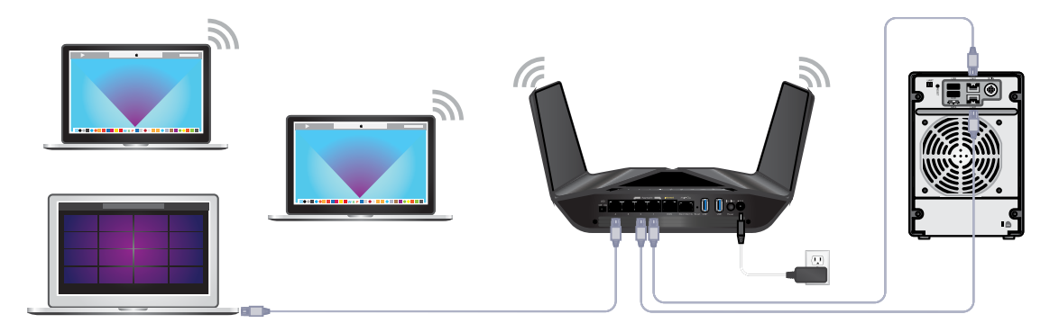
Figure 7. Ethernet port aggregation to a LAN device

WARNING: Do not connect an unmanaged switch to Ethernet ports 1 and 2 on your router if these ports are aggregated. Otherwise, a network loop occurs, and your network might be shut down.