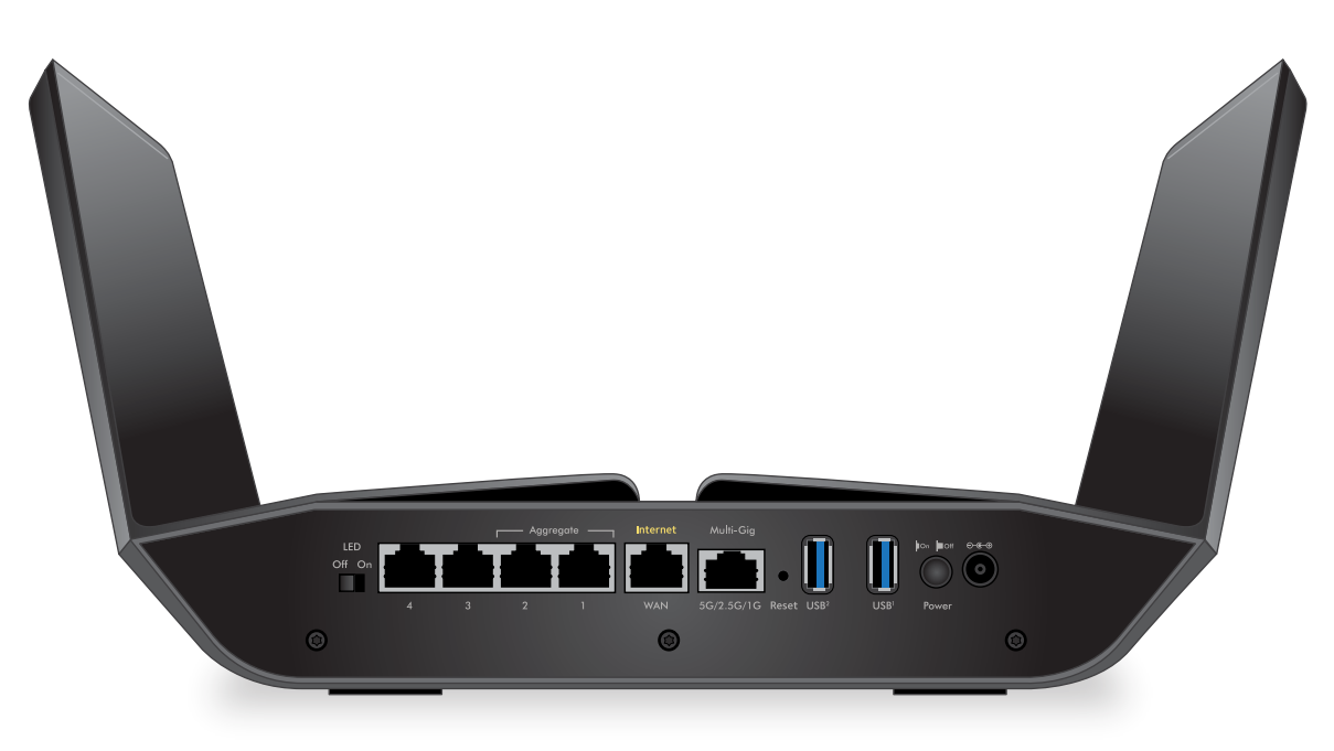
Figure 3. Rear panel

The following figure shows the rear panel connectors and buttons.