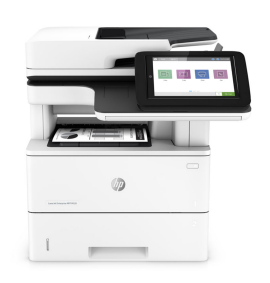
HP LaserJet Enterprise MFP M528dn

Choose an HP LaserJet Enterprise MFP designed to handle business solutions securely and efficiently, and helps conserve energy with HP EcoSmart black toner. Keep up with the demands of growing business with a printer you can rely on.