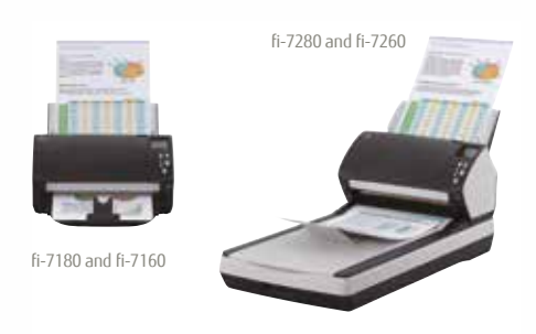
fi-7160 / fi-7260 – A4 Portrait at 300 dpi 60 ppm / 120 ipm fi-7180 / fi-7280 – A4 Portrait at 300 dpi 80 ppm / 160 ipm Scan mixed batches through the 80 sheet ADF