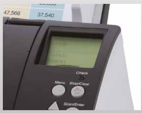
Integrated LCD operating panel

These are the first desktop scanners in the World equipped with iSOP (Intelligent Sonic Paper Protection), which detects changes in the acoustic noise generated by paper and enhances the paper feeding process. Additionally they feature innovatively developed hardware and software to help augment your daily routines and boost your organisation's efficiency.