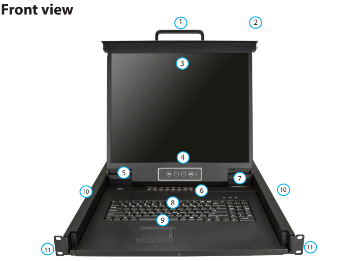
*actual product may vary from photos