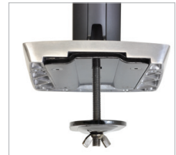
Grommet Accessory for WorkFit-A 97-692