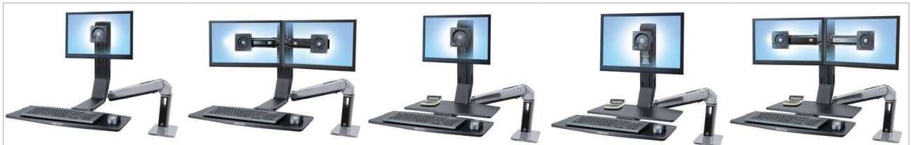
WorkFit-A, LCD LD