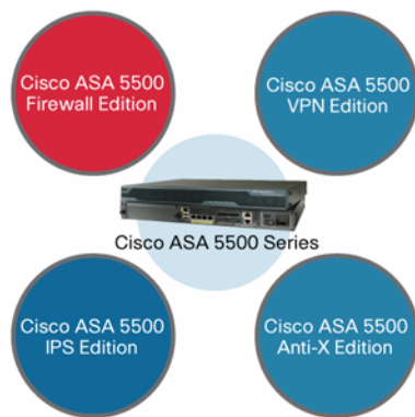
Figure 2. Complementary Solutions

These packages enable superior protection by providing the right services for the right location. At the same time, they enable standardization on the Cisco ASA 5500 Series platform to reduce costs in management, training, and sparing. Finally, each Edition simplifies design and deployment by providing pre-packaged location-specific security solutions.