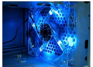
120mm front silent fan (BLUE LED)