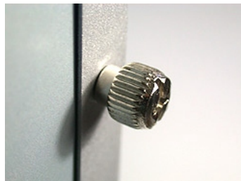
Thumb-screws for easy open side panel