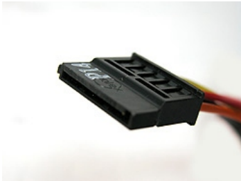
380W Power Supply (Option) Support 2 Serial ATA ports for hard disk