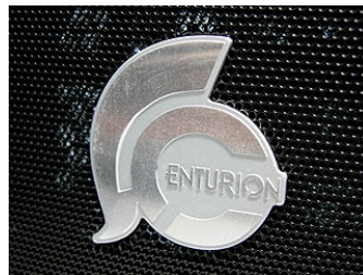
Stylish Centurion Logo