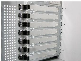
Tool-less installation for cards