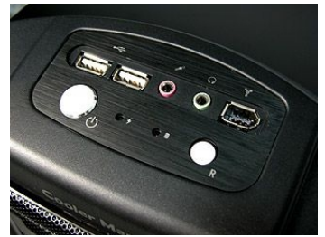
Dual USB2.0, IEEE1394, audio, speaker ports