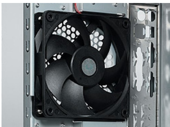
120mm rear silent fan (option)