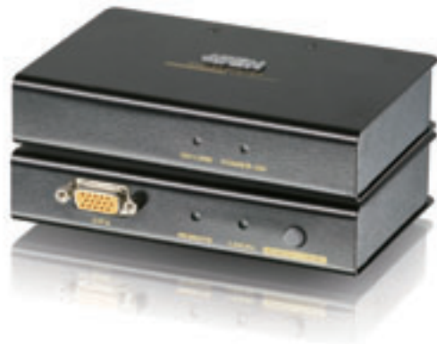
CE250AR (Remote unit)