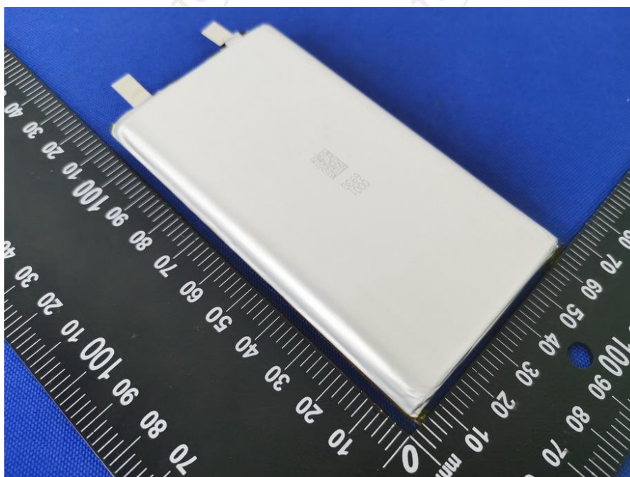
Picture 2. Cell view