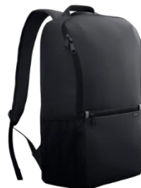
Dell 14-16 EcoLoop Backpack - CP3724

Collaborate confidently with this 2K QHD webcam that's essential for everyday use.