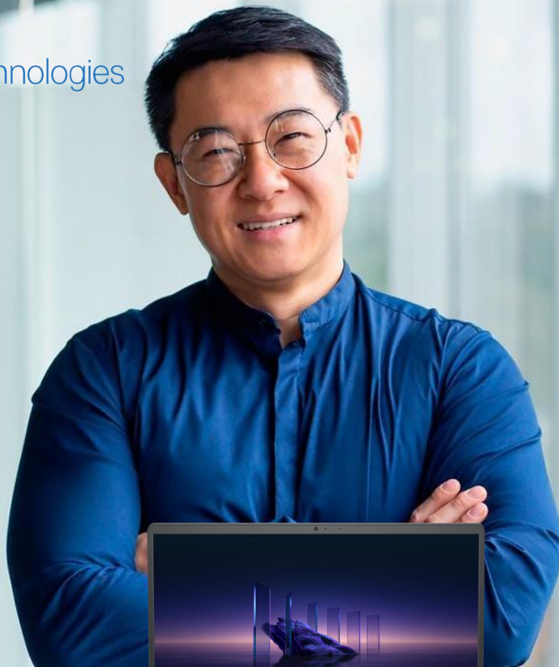
Dell Pro 15 Essential (PV15250/PV15255)