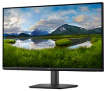
Dell Pro 27 Monitor - E2725HM

Get the essentials to enhance productivity with this 27-inch fixed-stand monitor certified by TÜV Rheinland® for 3-star eye comfort.