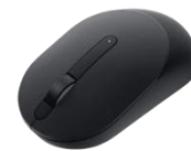
Dell Pro Mouse - MS300

A sustainably made, everyday backpack with a large, full-access front opening and protection features that shield your laptop and essentials.