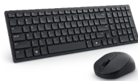
Dell Pro Compact Silent Keyboard and Mouse - KM555

Get the essentials to enhance productivity with this 27-inch fixed-stand monitor certified by TÜV Rheinland® for 3-star eye comfort.