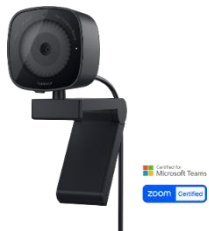
Dell Webcam - WB3023

Experience uninterrupted communication with this wireless headset featuring an AI-based noise cancellation microphone, designed with productivity and comfort in mind for all-day conferencing.