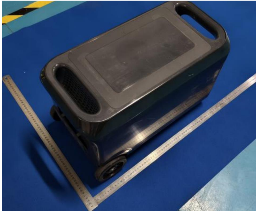
Picture 1. Front view of battery 图片 1. 电池组前视图