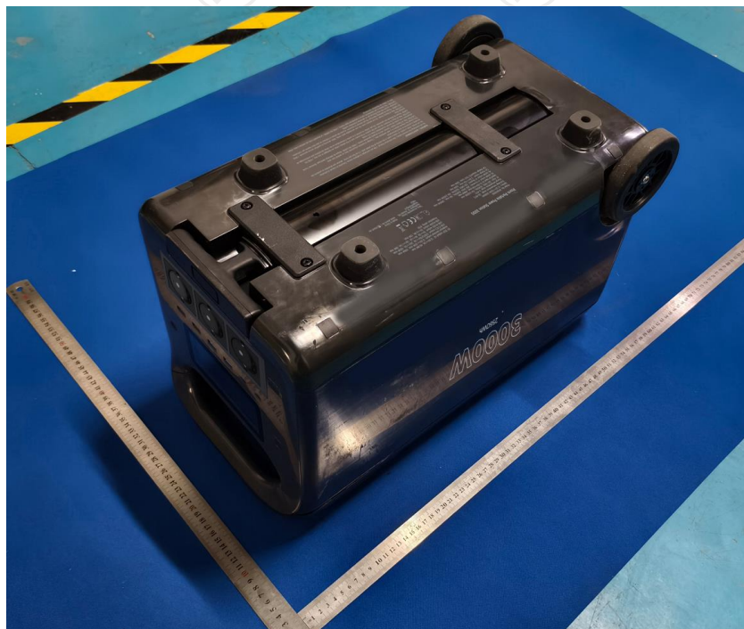
Picture 2. Back view of battery 图片 2. 电池组后视图