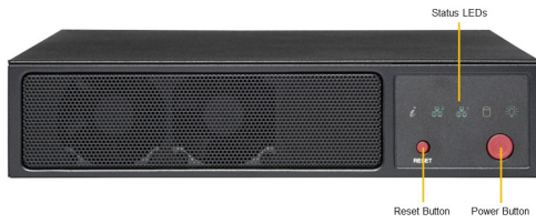
(Front View – System)