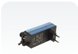
24V 1.5A power adapter