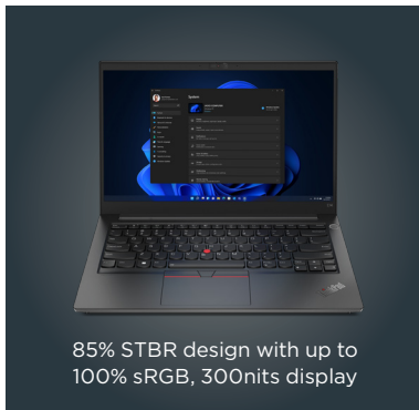
85% STBR design with up to 100% sRGB, 300nits display