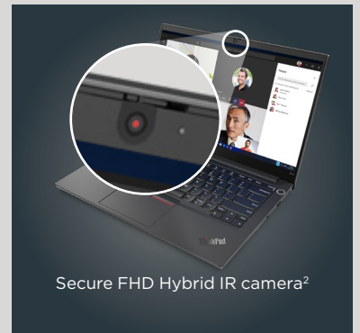
Secure FHD Hybrid IR camera 2