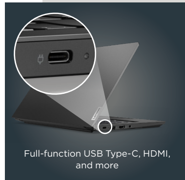
Full-function USB Type-C, HDMI, and more